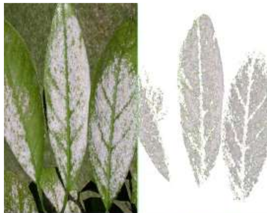
Figure 6. Input and output image of guava and palm leaves and output disease is fungal disease