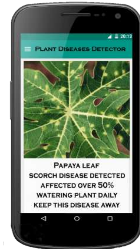
Figure 9.Instant result

only two steps viz capturing the infected leaf and next uploading it through this application. It will automatically detect the disease and display the result instantly. The other processes are done in the database server. The extension of this work will focus on developing algorithms in order to increase the recognition rate of classification process.