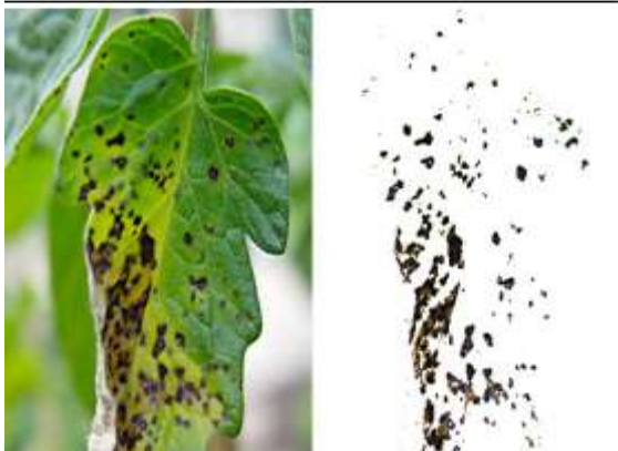
Figure 5. Input and output image of mango and banana leaves and output is sunburn disease