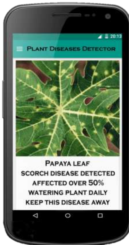
Figure 9.Instant result

only two steps viz capturing the infected leaf and next uploading it through this application. It will automatically detect the disease and display the result instantly. The other processes are done in the database server. The extension of this work will focus on developing algorithms in order to increase the recognition rate of classification process.