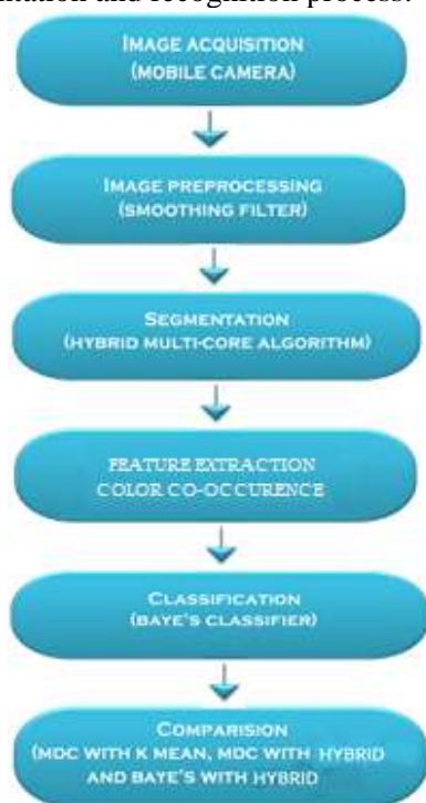
Figure 1.Steps of proposed methodology

Mobile camera is utilized to take images of leafs of various types, and afterward these images are used to distinguish the affected area in leaves. Different types of image processing techniques are applied on them, to process those images for getting distinctive and valuable components required for the purpose of investigation in the later stages. In this proposed system, the application encourages the user to give the picture of the leaf as the input. The framework applies algorithm to infer fundamental parameters identified with the properties of the leaf. It then compares these parameters and the ones stored against a leaf section in the database. On fruitful match of the disease, the application shows information related to that specific disease to the client for his review. Moreover, the framework additionally encourages the client to report false reports produced by the application in order to sharpen its outcomes in future. Figure 1 illustrates the step by step procedure for the proposed image segmentation and recognition process: