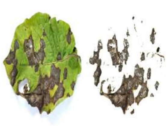
Figure 4. Input and output image of potato and tomato leaves and output disease is bacterial disease