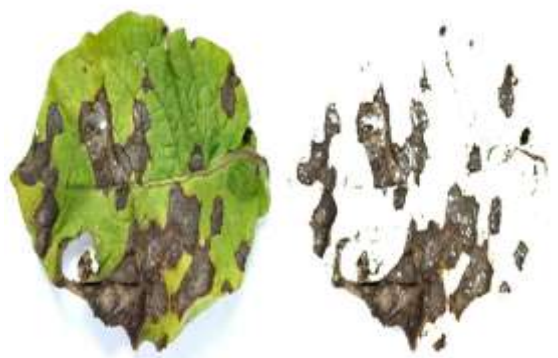
Figure 4. Input and output image of potato and tomato leaves and output disease is bacterial disease