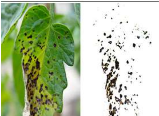
Figure 5. Input and output image of mango and banana leaves and output is sunburn disease