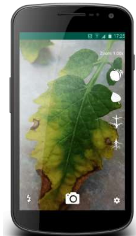
Figure 2.Snap of the plant leaf with disease in mobile

where \lambda \geq 0 is a smoothing parameter.